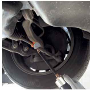
Releases steering linkages