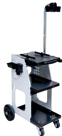
PN. 051331 + 052284 UNIVERSAL 800 + Over hanging arm