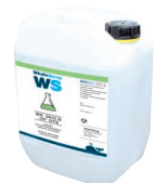
PN. 062511 Welding coolant - 5 l