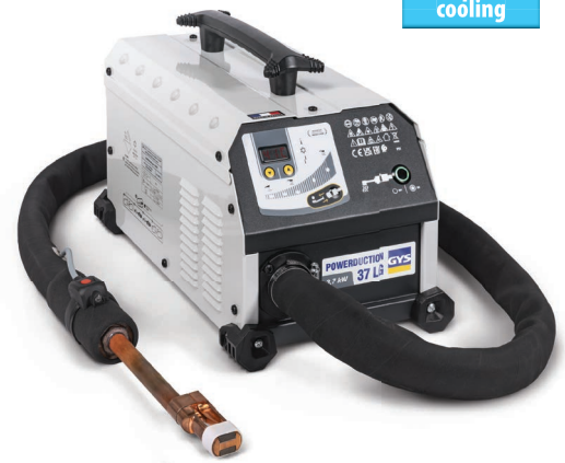
Supplied with a complete inductor S180/B3W.