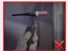
Light shade 3