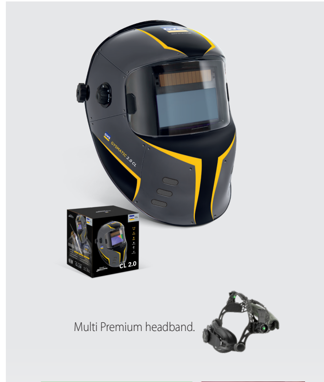
Multi Premium headband.