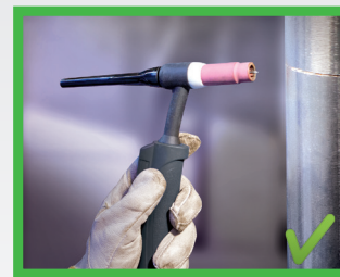
Light shade 2 (before welding)