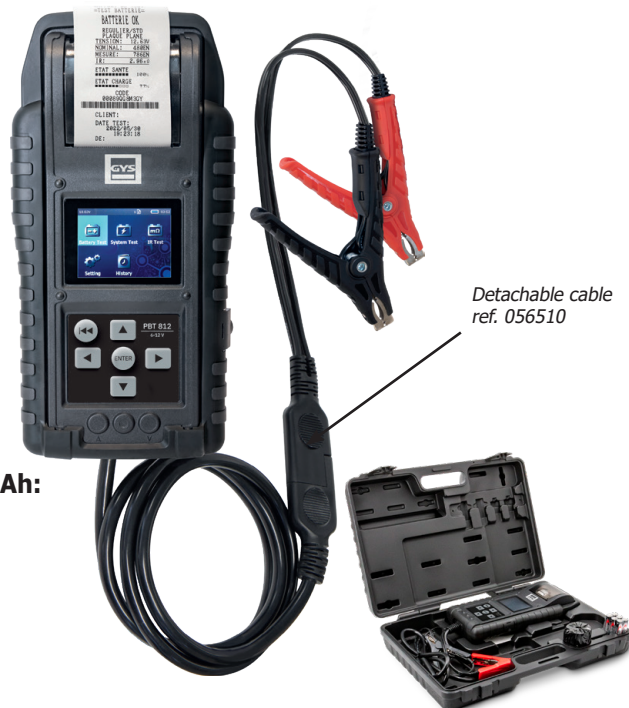
Detachable cable ref. 056510

Supplied in a carry case with 1 roll of printing paper (wide paper - 2 inches).