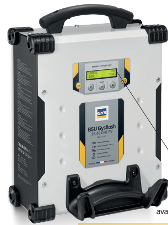
Intuitive interface available in 22 languages