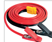
Clamps 5 m - 10 mm 2