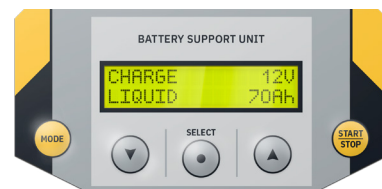
Intuitive interface available in 22 languages