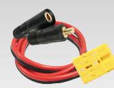
Anderson Cable > Texas 055902 - 0.2 m - 16 mm 2 028791 - 1 m - 16 mm 2