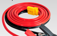
Anderson Cable > Pliers 056503 - 2.5 m - 16 mm 2 054615 - 5 m - 16 mm 2 056572 - 8 m - 16 mm 2