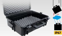
Carry case 060432