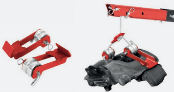
Lifting hook for brake caliper