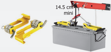
Lifting hook for battery