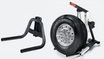
Lifting fork for wheel Ø from 60 to 120 cm 200 Kg Max

Directly lift hub and disk assemblies with the cable and hook.