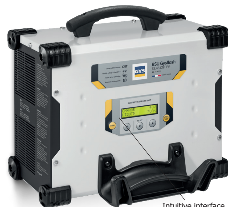
Intuitive interface available in 22 languages